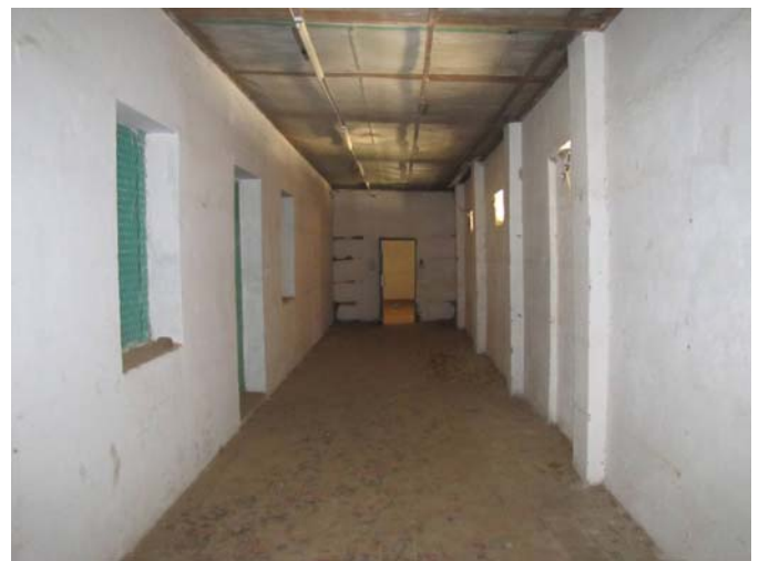
The newly rented project facility in Humera featuring views of the courtyard and bathrooms (Top photos) and internal rooms (bottom)