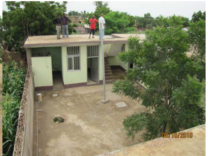
A much smaller facility was rented in Sheraro with two large rooms for labs and several small rooms to serve as residential and storage rooms. This facility is new so requires only minor final touches (e.g. floors and toilets)