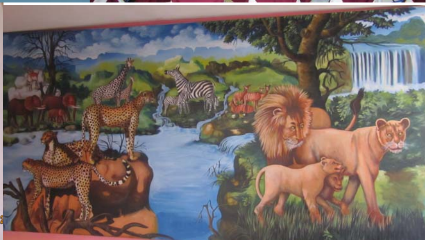
The Milano Hotel in Mekele: The “Pink Suite” (top right). The “Pink Carnation” meeting hall. A wall mural depicting local wildlife and informative signs (not from the Hotel)